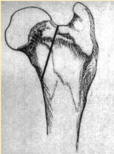
The figure illustrates the portion of bone that is removed during FHO

The FHO is a simpler operation (compared with TPO) that is intended to eliminate pain by preventing contact between the femur (the bone of the upper leg) and the pelvis. This is accomplished by removing the head portion of the femur and allowing the formation of a "false joint" between the pelvis and the femur. This procedure is done in humans (Girdlestone operation) and has been used for many years in dogs and cats. It is highly successful in cats and small dogs, and has been successful in larger dogs as well, but the result is not as predictable in larger dogs